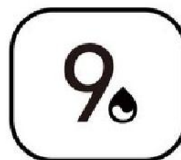
9 Grades Of Wood Density